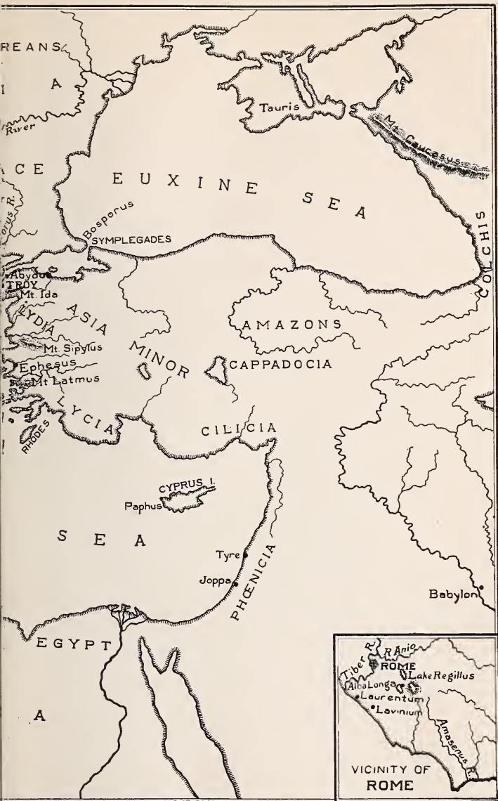
MAP OF PLACES MENTIONED IN "STORIES OF GODS AND HEROES."